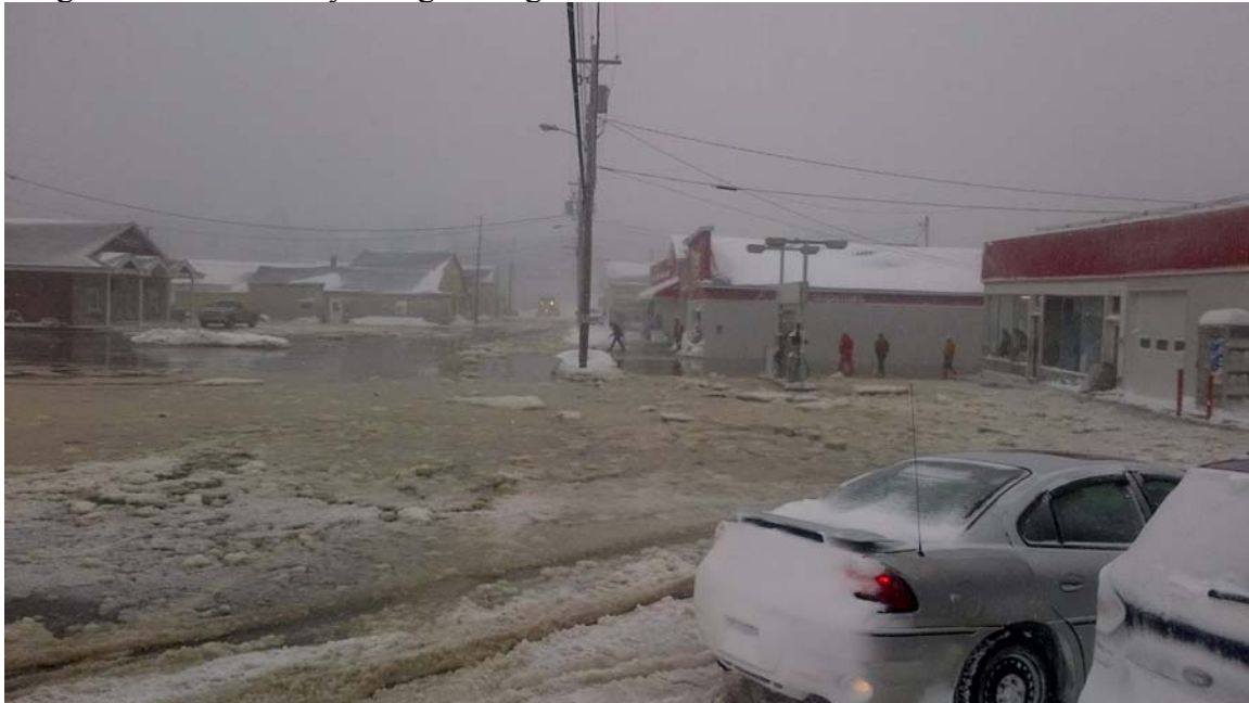
Late in 2013, Clare experienced a winter storm in which storm surge caused flooding and coastal erosion just where newly completed inundation maps had predicted it would occur.

Clare’s Municipal Climate Change Adaptation Plan (MCCAP), prepared largely by a planning firm in Halifax supported with gas tax funds, includes maps depicting areas that would be most vulnerable to sea-level rise, storm surge and erosion. The long shoreline of Clare is considered at moderate-to-high risk due to a combination of winds, currents and tides along its coast and the geologic substrate there. Within months of submitting its MCCAP, the community experienced a winter storm that demonstrated just what the modeling had predicted—storm surge flooding in low-lying areas and evident erosion. “Sometimes the planning work can feel theoretical, but we know now it can happen,” says Clare’s Administrative Assistant to the CAO Colette Deveau King. “That storm really brought things home.”