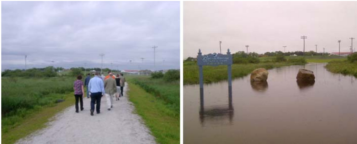
Yarmouth celebrated the opening of a new park in June 2013, but the park path was submerged within a week.

grand opening celebrating a new park and within a few days, MacDonald reports, the park was under water.