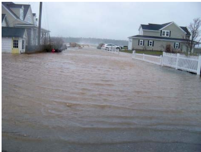
St. Andrews, New Brunswick in a November 2010 storm that brought up to 13 cm. (5 in.) in a 24-hour period.

Two storms with intense precipitation and storm surge late in 2010 helped persuade residents of St. Andrews, a peninsula town, of the need to plan responses to sea-level rise and more frequent extreme storms. When trying to assess its future capacity for stormwater management, town officials quickly realized the need to better understand what they had and how it was functioning. They soon discovered, says Mayor Stan Choptiany, “220 years of mistakes in infrastructure design,” with cross-connections between sewer and stormwater, supersaturated soils forcing water into building basements, and many sewer lines and culverts in critical need of replacement. An abandoned municipal dump near the shore will erode more with sea-level rise, possibly exposing hazardous waste requiring remediation.